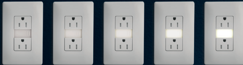
5 Adjustable Light Settings with Soft Glow energy-efficient LEDs

From tamper-resistant to touch-control to GFCI combos, we now offer a full line of Night Light devices designed to meet the demands of every end user and installer. So, whether your customers are looking to install extra nighttime convenience, control, safety — or all three — make sure you make it a P&S Night Light solution from Legrand.