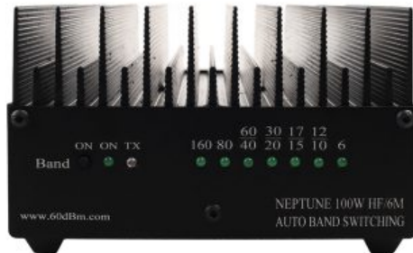
100 Watt HF/6m Power Amplifier for Yaesu FT-817, Icom IC-703/705, Elecraft KX3, automatic band switching